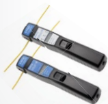
Live Fiber Identifier/ Tone Generator LFD-300B/TG-300B